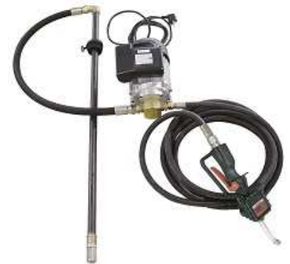
EA-88 Pump + PMGE-40 Nozzle

#Excludes Drum / IBC - Carry Handle + Hose Hooks Optional