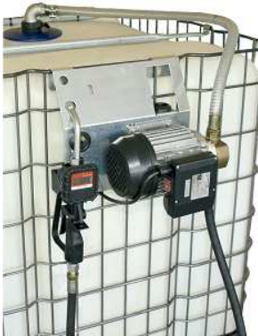
KDE-1000 with EA-88 Pump + PMGE-40 Nozzle + 4m Hose + Base