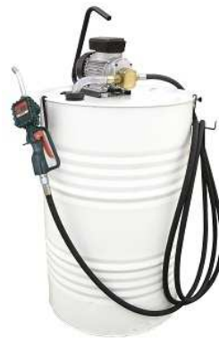
KDE-200 with EA-88 Pump + PMGE-40 Nozzle + 4m Hose